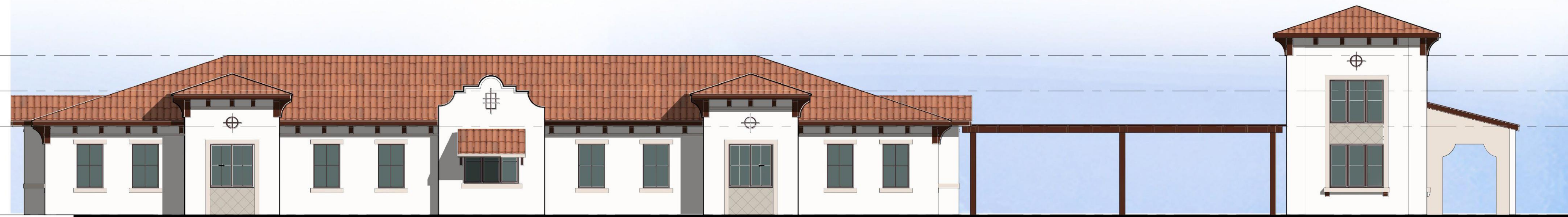
2. ELEVATION 2 1/8" = 1'-0"

● TOP OF THE ROOF ELEV. +18' - 0" ● MEDIAN ROOF ELEV. +14' - 0" ● TOP OF BEAM ELEV. +10' - 0" ● GROUND LEVEL ELEV. +0' - 0"