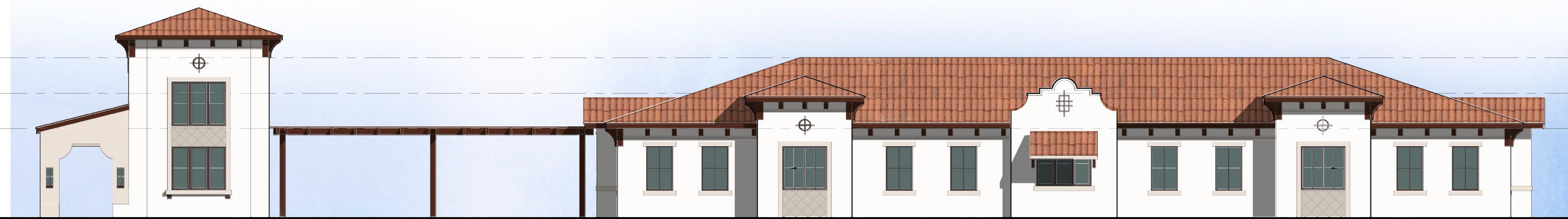
1. ELEVATION 1 1/8" = 1'-0"

● TOP OF THE ROOF ELEV. +18' - 0" ● MEDIAN ROOF ELEV. +14' - 0" ● TOP OF BEAM ELEV. +10' - 0" ● GROUND LEVEL ELEV. +0' - 0"