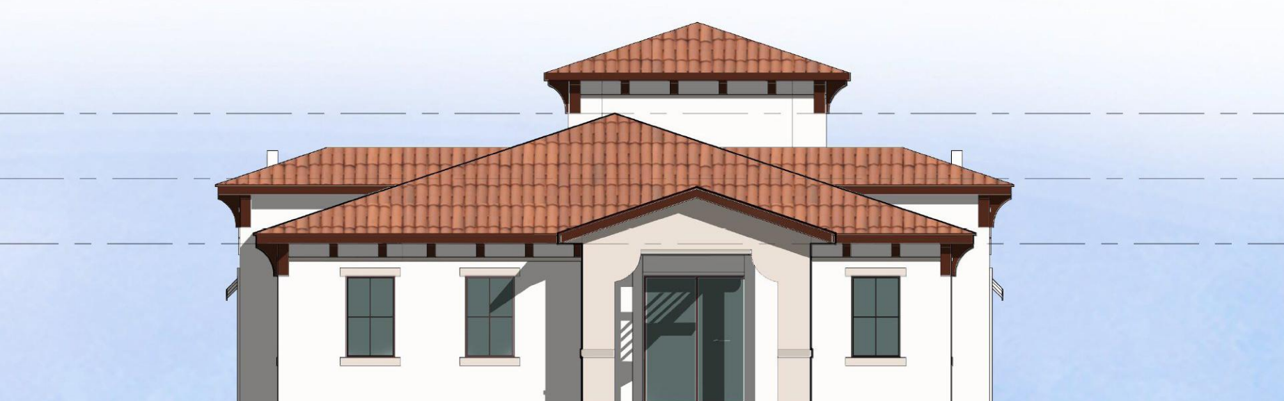
4. ELEVATION 4 1/8" = 1'-0"

● TOP OF THE ROOF ELEV. +18' - 0" ● MEDIAN ROOF ELEV. +14' - 0" ● TOP OF BEAM ELEV. +10' - 0" ● GROUND LEVEL ELEV. +0' - 0"