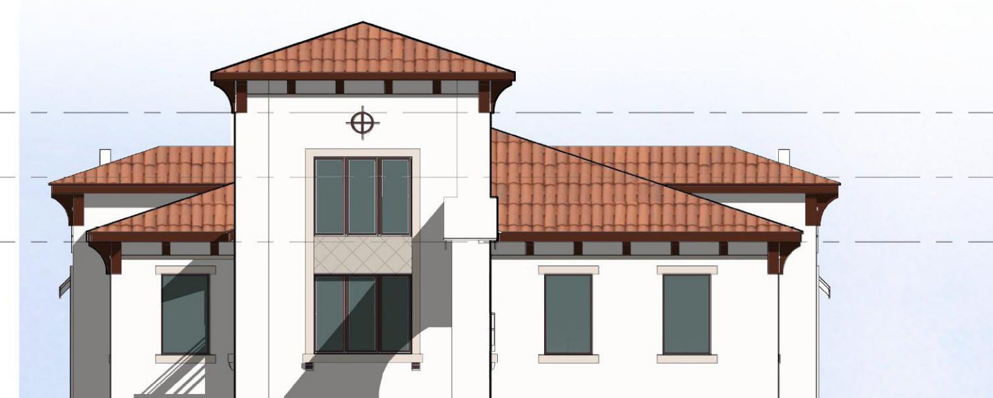
3. ELEVATION 3 1/8" = 1'-0"

● TOP OF THE ROOF ELEV. +18' - 0" ● MEDIAN ROOF ELEV. +14' - 0" ● TOP OF BEAM ELEV. +10' - 0" ● GROUND LEVEL ELEV. +0' - 0"